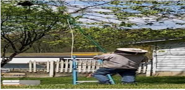
Philip Coy Catching a swarm High in a tree