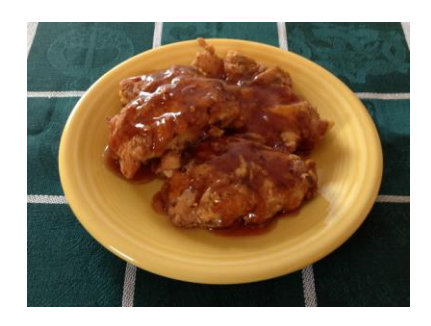
Honey Garlic Chicken