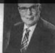
Director in Charge