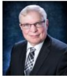
Director in Charge